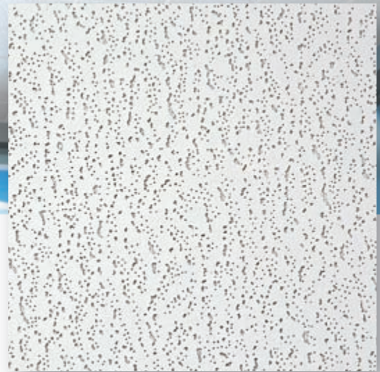
Surface pattern Harmony Harmony 72