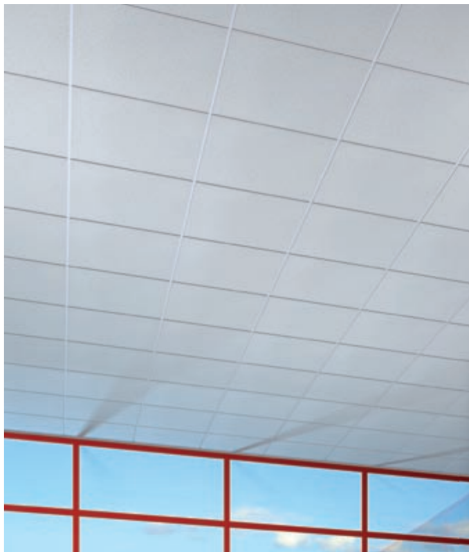
Surface pattern Futura Futura 60